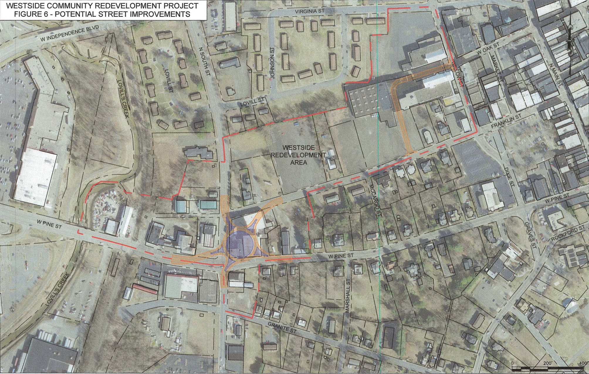
WESTSIDE COMMUNITY REDEVELOPMENT PROJECT FIGURE 6 - POTENTIAL STREET IMPROVEMENTS