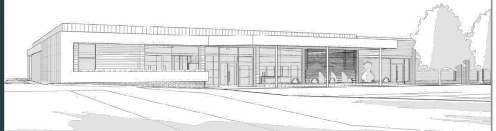
Rendering of new municipal offices, slated to begin this year.