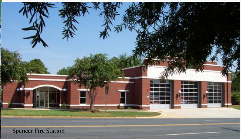
Spencer Fire Station

The immediate agenda of the Board includes responding appropriately to the COVID-19 crisis but also looking ahead to growth and the many projects which are currently planned, such as the redevelopment of Park Plaza Center and the development of a multi-use site on the Yadkin River. Excellence in customer service is the Board's top priority. The work of town management is to maintain and improve services to citizens. The Town of Spencer enjoys the benefits of a diverse population and the town's management is expected to understand and appreciate those opportunities for service delivery. The Town of Spencer would also benefit from increased business growth and seeks to encourage those initiatives. Efforts are currently underway towards increased beautification, community development, and capitalizing on 160,000 visitors coming into the community each year. The intent of these efforts, along with capital improvement projects, is to revitalize the town and to rebuild and expand the tax base.