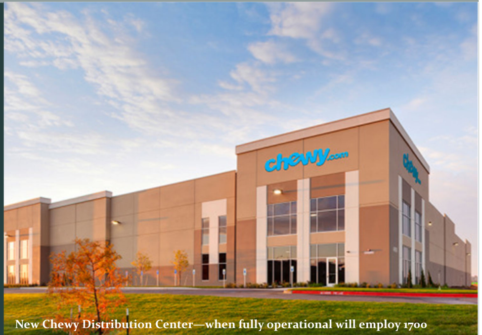
New Chewy Distribution Center—when fully operational will employ 1700