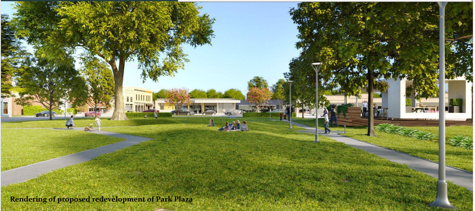
Rendering of proposed redevelopment of Park Plaza