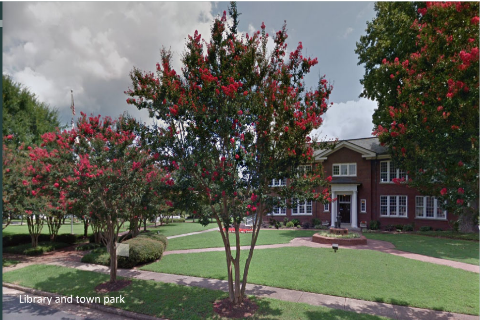
Library and town park

The Board's expectation is that the Assistant Town Manager will work with the current Interim Town Manager over a period of months to learn the Town's operations and get to know the community. As performance proves the hiring decision then the Assistant Town Manager will be eligible for promotion to Town Manager.